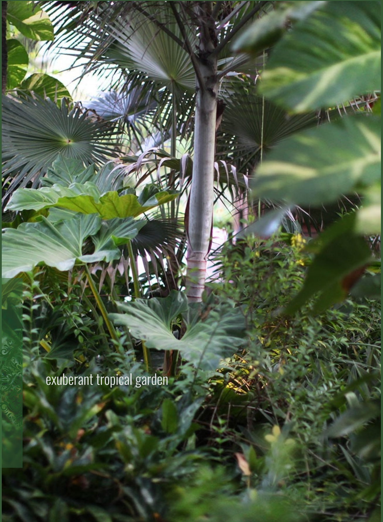
exuberant tropical garden